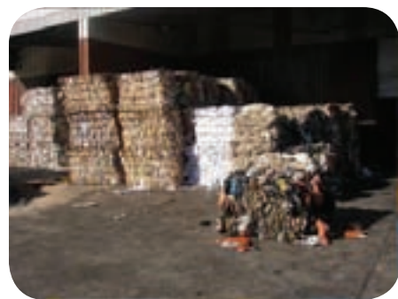
Baled cardboard and paper at ARTS