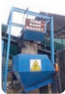
Magnet for collection of metals collection