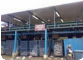
Sorting line at Mariannahill's Materials Recovery Facility