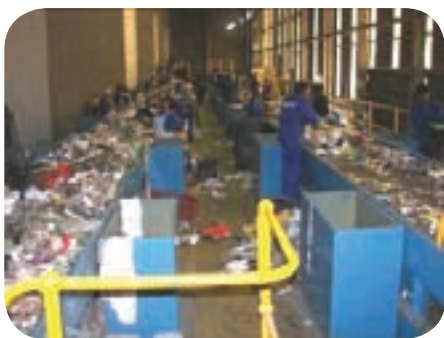
Sorting Line at the ARTS Recycling Initiative

Municipal solid waste (MSW) is offloaded in the receiving apron, compacted into sealed containers (each containing 20 tonnes of refuse) and transported by rail at a rate of about 52 containers a day to Visserhok landfill (Agama Energy & The Sustainability Institute. 2007). The facility is designed to handle 850 tonnes per day but is accepting over 1,000 t/d. The characterisation of this refuse is expected to contain an organic fraction of 47%, 45% of recyclables and 8% of 'other' waste (Agama Energy & The Sustainability Institute. 2007).