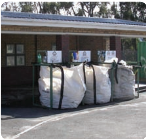
PETCO/CCT drop off initiative

Another initiative, the "blue bag" project in Stellenbosch, has been successfully running since 2004. Nearly 1,500 households separate tin, glass and newspaper which are placed in blue bags supplied by Stellenbosch Municipality. These bags are then collected by local buy back centres. Public private partnerships are important for the success of recycling initiatives. An example of an effective public private partnership is the arrangement between the City of Cape Town and PETCO, who have sponsored bags for the collection of PET, HDPE and LDPE for recycling in the CCT.