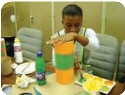
Off-cuts of paper cores and cores converted into decorative containers