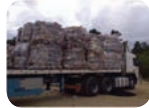
Bailed goods to be sold for re-processing