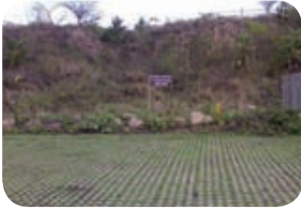
Stormwater attenuation wetland at Marianhill