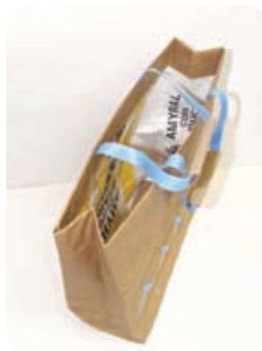
Starch bag before and after conversion