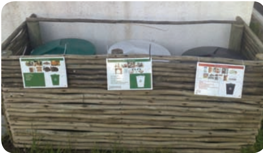
Examples of the 3-bin units and signage

The non-recyclable waste has been reduced to an average of 15 black bin bags per week (reduction of 70%). In addition, the site now delivers 20 bags of recyclable materials weekly, with the balance of material consisting of cardboard / paper and glass which are separated. Mr Recycle collects all the recyclables with the exception of the glass, which the Lynedoch garden and grounds team recycle as a separate business opportunity.