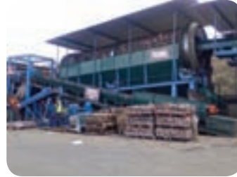
Transfer line and trommel