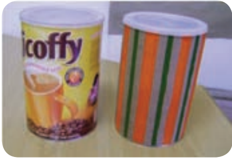
Coffee tin before and after conversion